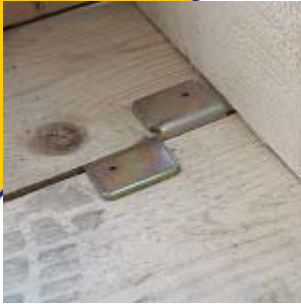
Board Retaining Clamp

Boards are quickly and securely locked in the correct position. With considerable resistance to both lateral and upward movement their use is recommended in windy conditions.